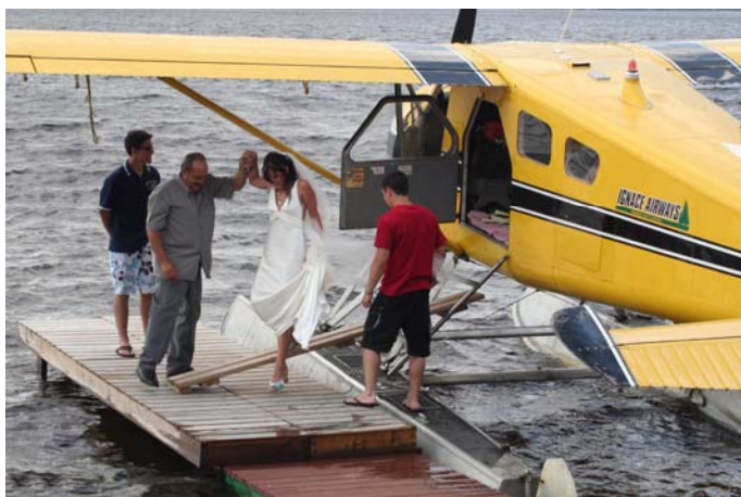
Here comes the bride!